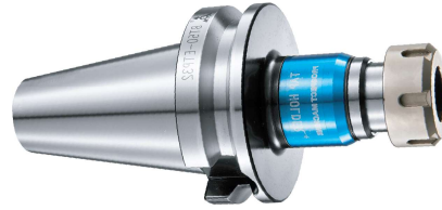
BT- ER 弹性攻丝刀柄